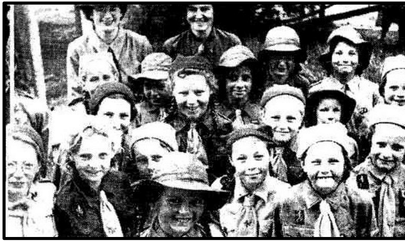
The Yallourn Brownies in February 1948.