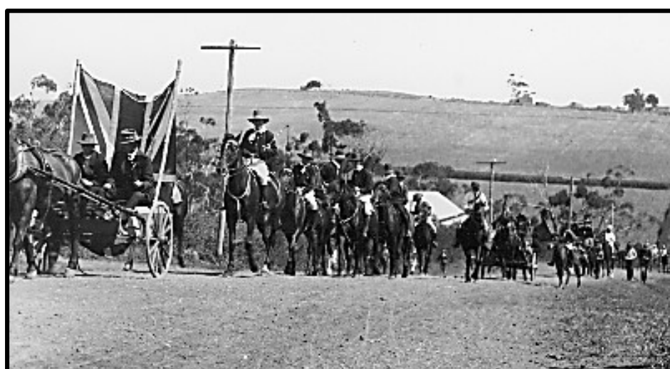
A photograph of tree planting day celebrations in earlier times.

Extract summary as provided by the SLV: "Line of horsemen on dirt road, horse and buggy displaying the Union Jack in front of procession, men on horseback all dressed in matching, riding pants, shirts, bandanas and wide brimmed hats, road in background stretching up through paddocks. Possibly celebrating Arbor Day."