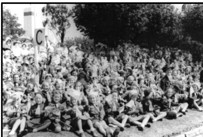
This 'famous' photograph of the Yallourn Brownies was taken in 1954 when Queen Elizabeth visited Yallourn.