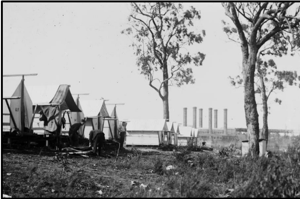
The workers' tents at the West Camp, Yallourn, and the stacks from the power station can be seen in the distance