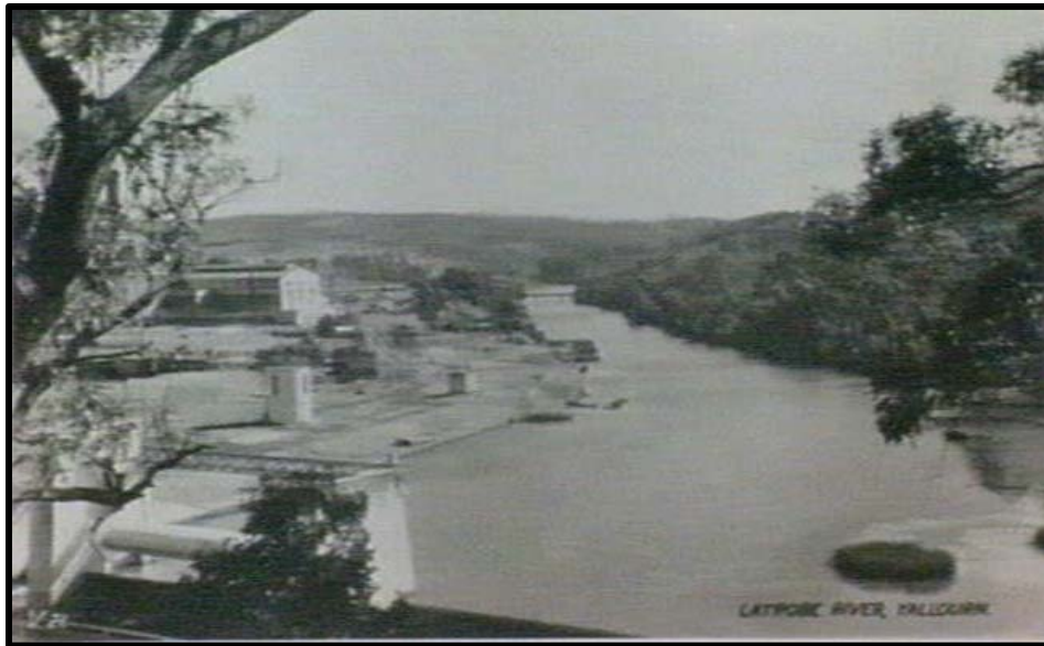
Early days along the banks of the Latrobe River at Yallourn

Yallourn also made the news when the 'The Argus' reported, on October 7 th , that flooding had occurred at the works area at Yallourn. The extract reported that the damage was relatively minor.