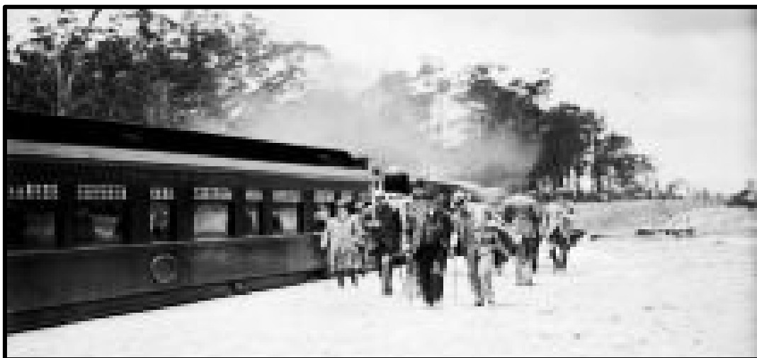
Visitors arriving at Yallourn by steam train