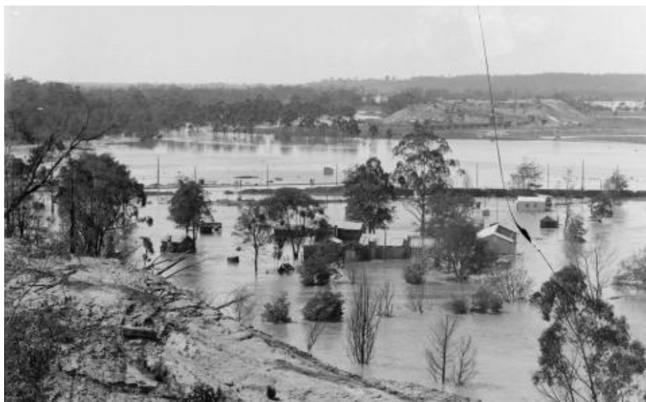
Another view of the Yallourn in 1927 –flooding at the SEC works area.