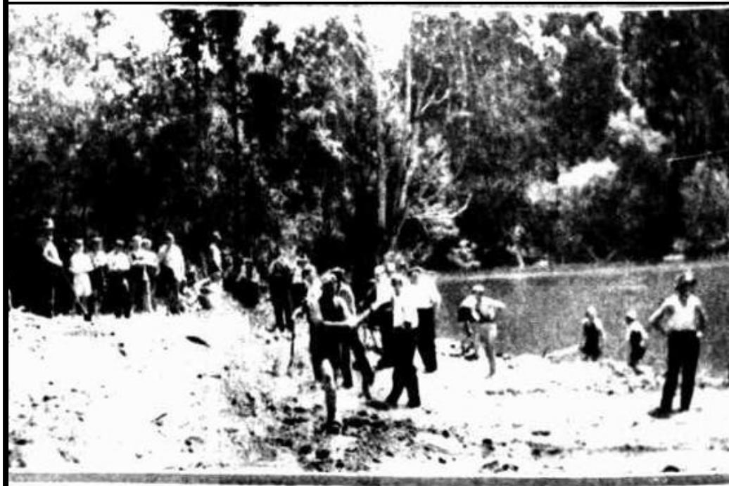
A working bee was arranged at Yallourn in preparation for 'Learn to Swim' week.—An excavation was made on the bank of the Latrobe River so that beginners might learn to swim in the shallow water of the River. More than a hundred men participated. The photographs show the volunteers at work.