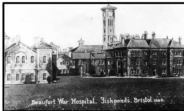
Beaufort War Hospital, Bristol, England

"He was sent to Beaufort War hospital in England for treatment after being gassed by a mustard shell..."