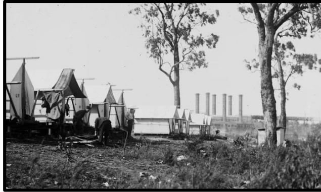
The West Camp tents – Six power station stacks can be seen in the background.