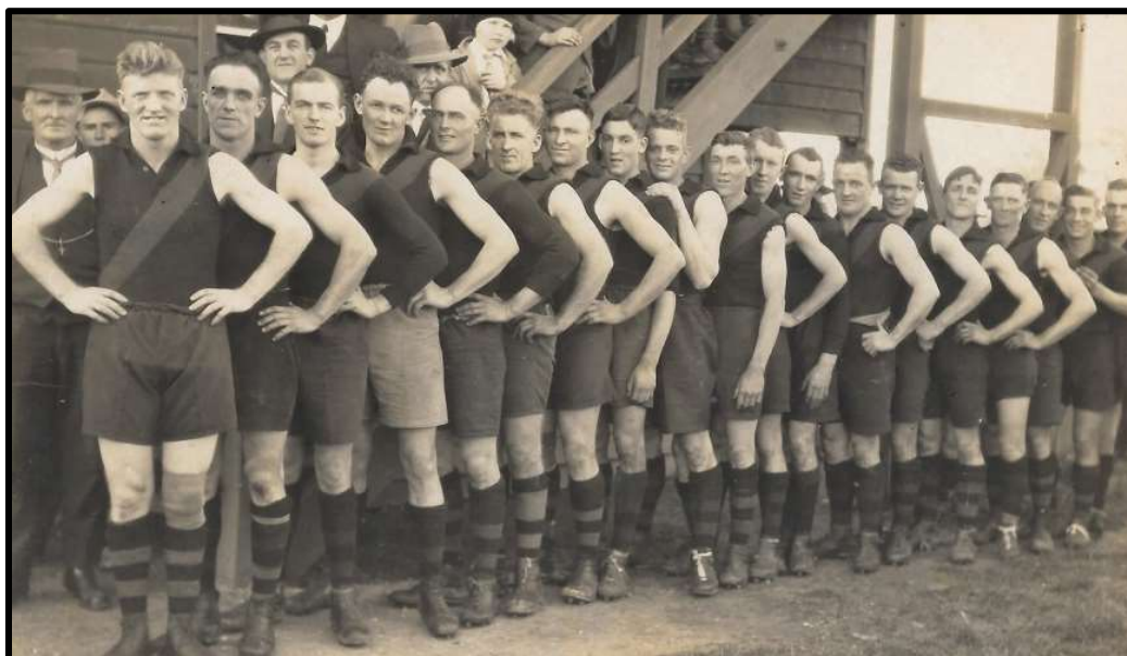
Yallourn Football Club, 1931.