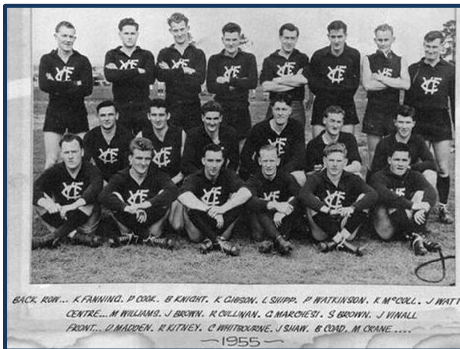
YALLOURN FOOTBALL CLUB—GRAND FINAL TEAM 1955