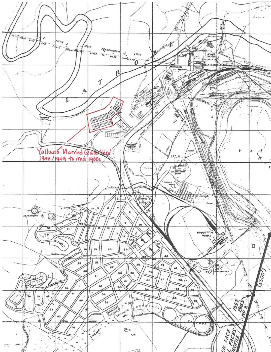
1960 Yallourn Open Cut Plan